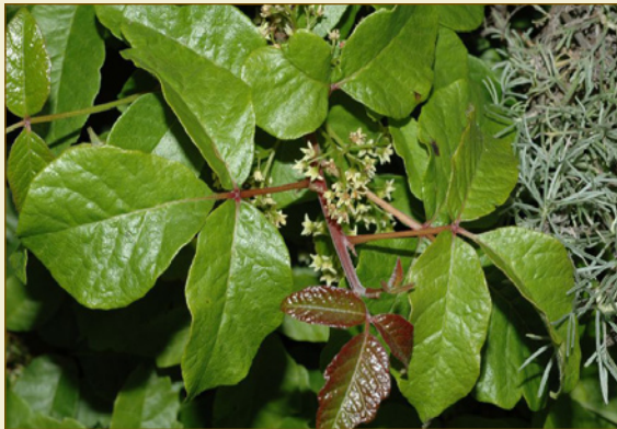
Poison Oak watch out for this on the waterfall trail